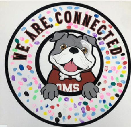
We Are Connected