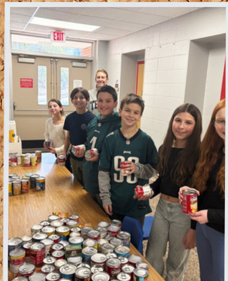
Attitude of Gratitude