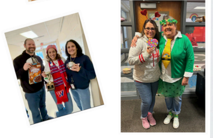
Underground Spirit Week