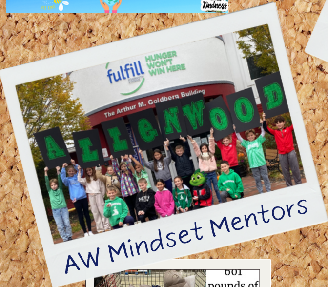
AW Mindset Mentors