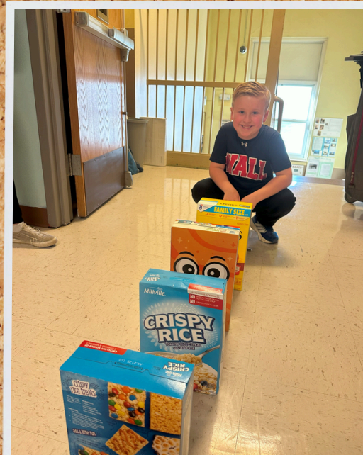
We Are Connected