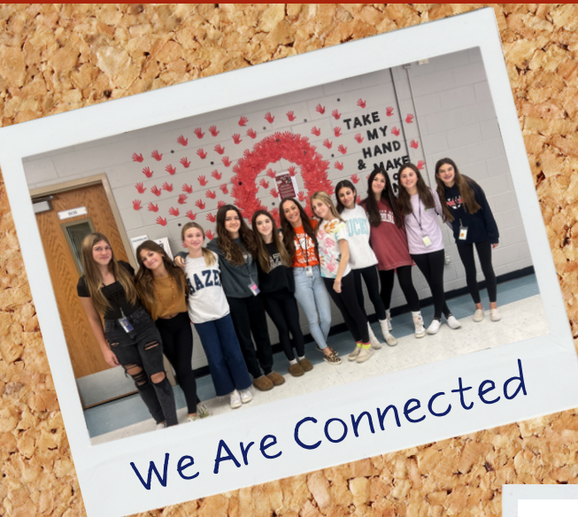
We Are Connected

WALL HIGH SCHOOL: Polar Plunge & Community Centered Leadership