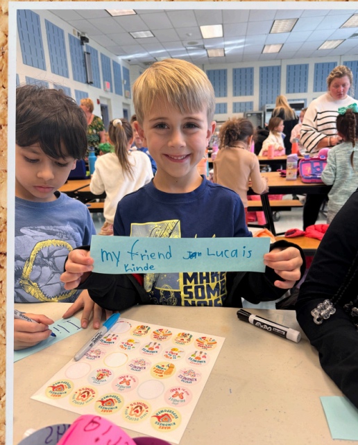
We Are Connected