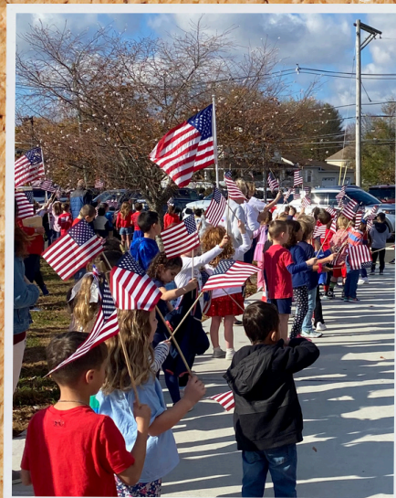
We Are Connected

601 pounds of food were donated, providing 551 meals!