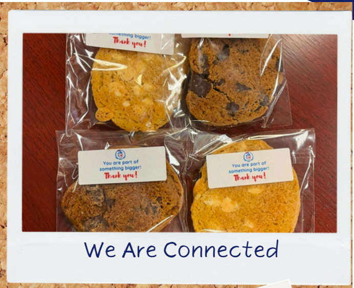
We Are Connected