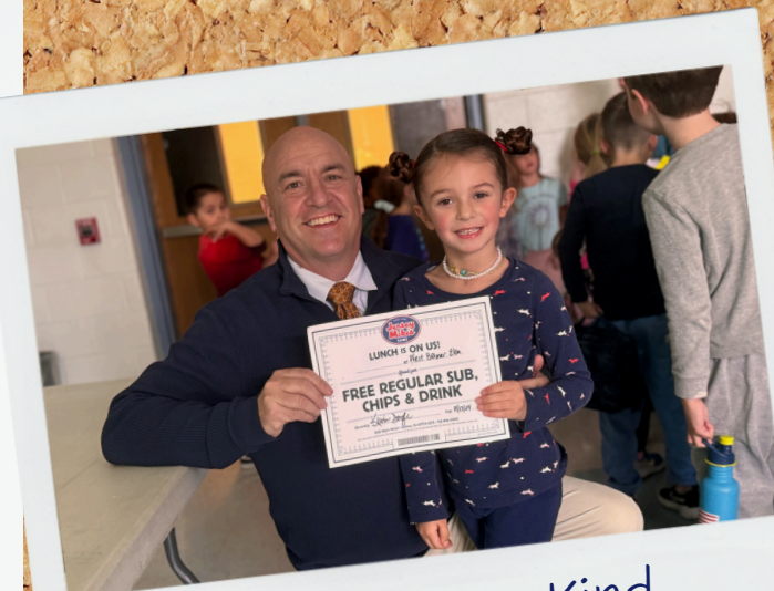
Caught Being Kind